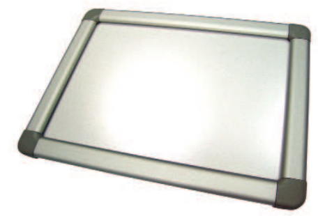
Standard Trappa Moulded Corner 25mm Frame AT401A - AT408A